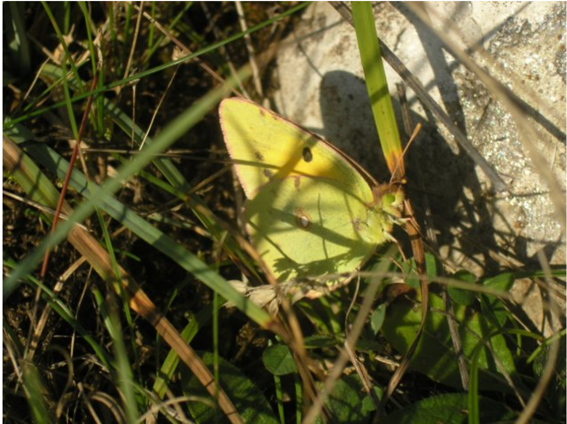
A Clouded Yellow butterfly in the Haggs pasture at Lower Winskill.

This is a migrant species from southern Europe which will also breed here during the summer. It is remarkable to think that this butterfly might have flown all the way from the shores of the Mediterranean to a hill farm in the Yorkshire Dales!