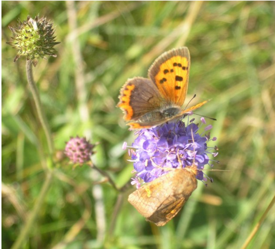
A Small Copper butterfly (top) feeding on devil's-bit scabious at Lower Winskill.