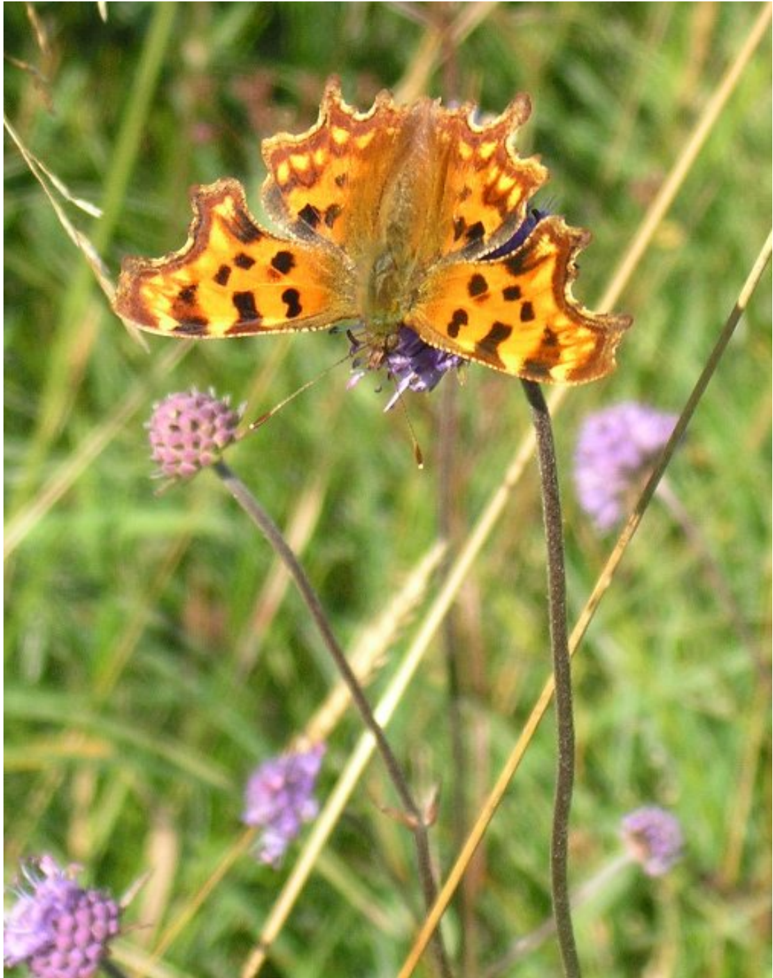
Comma butterfly feeding on devil's-bit scabious in the Crutching Close pasture at Lower Winskill.

The Comma butterfly is presently expanding its range northwards and this may be connected with climatic warming. This photograph taken at Lower Winskill in 2007 is the first record for the Comma butterfly on the farm.