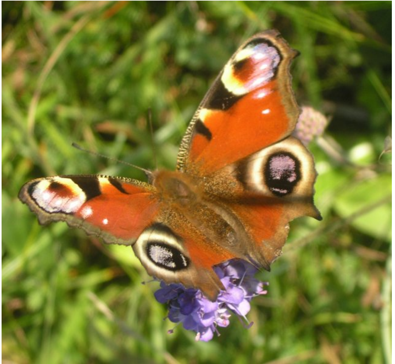
Peacock butterfly feeding on devil's-bit scabious in the Crutching Close pasture at Lower Winskill.

Devil's-bit scabious is a valuable late summer nectar source for butterflies.