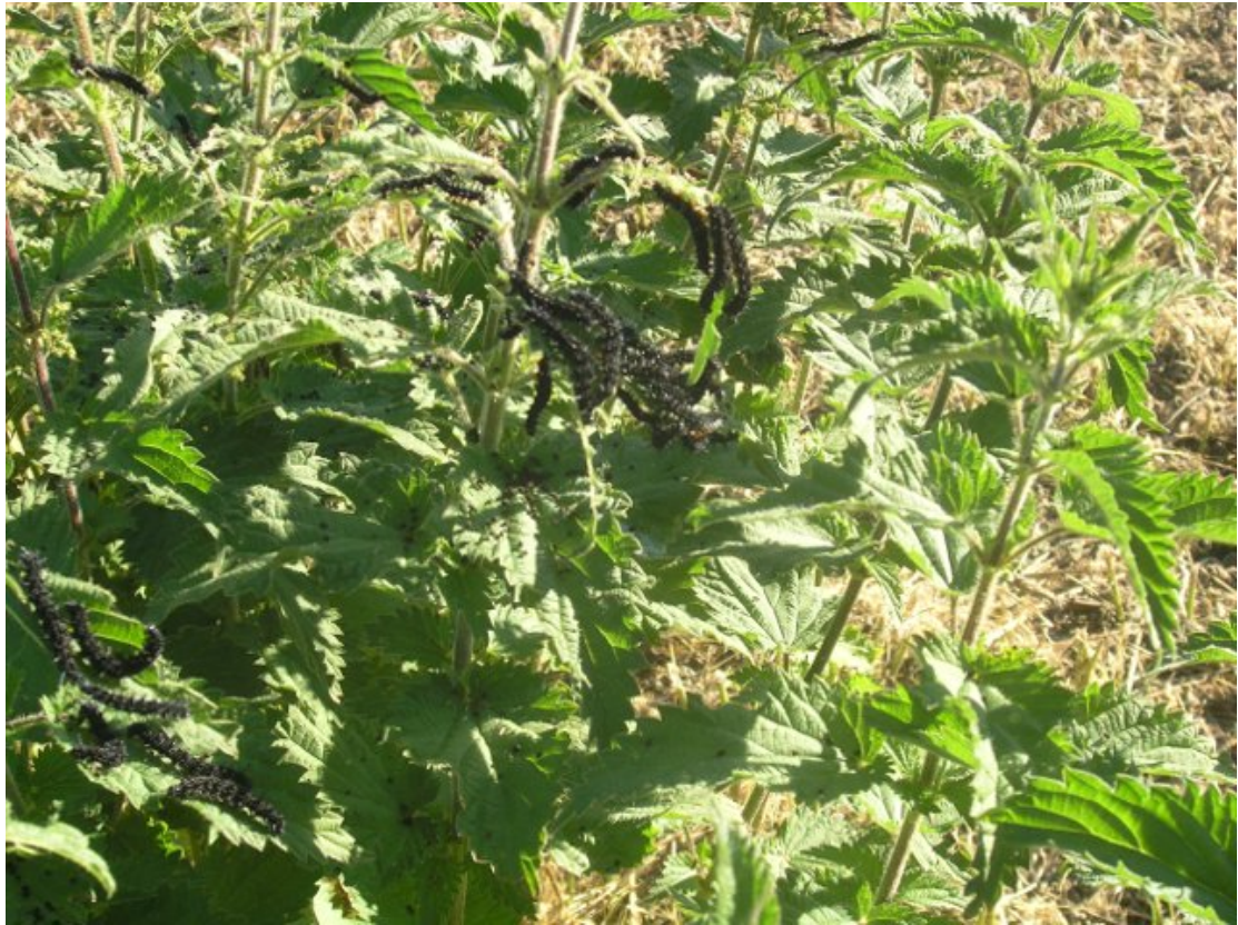
Peacock butterfly caterpillars feeding on a sunny clump of nettles at Lower Winskill.