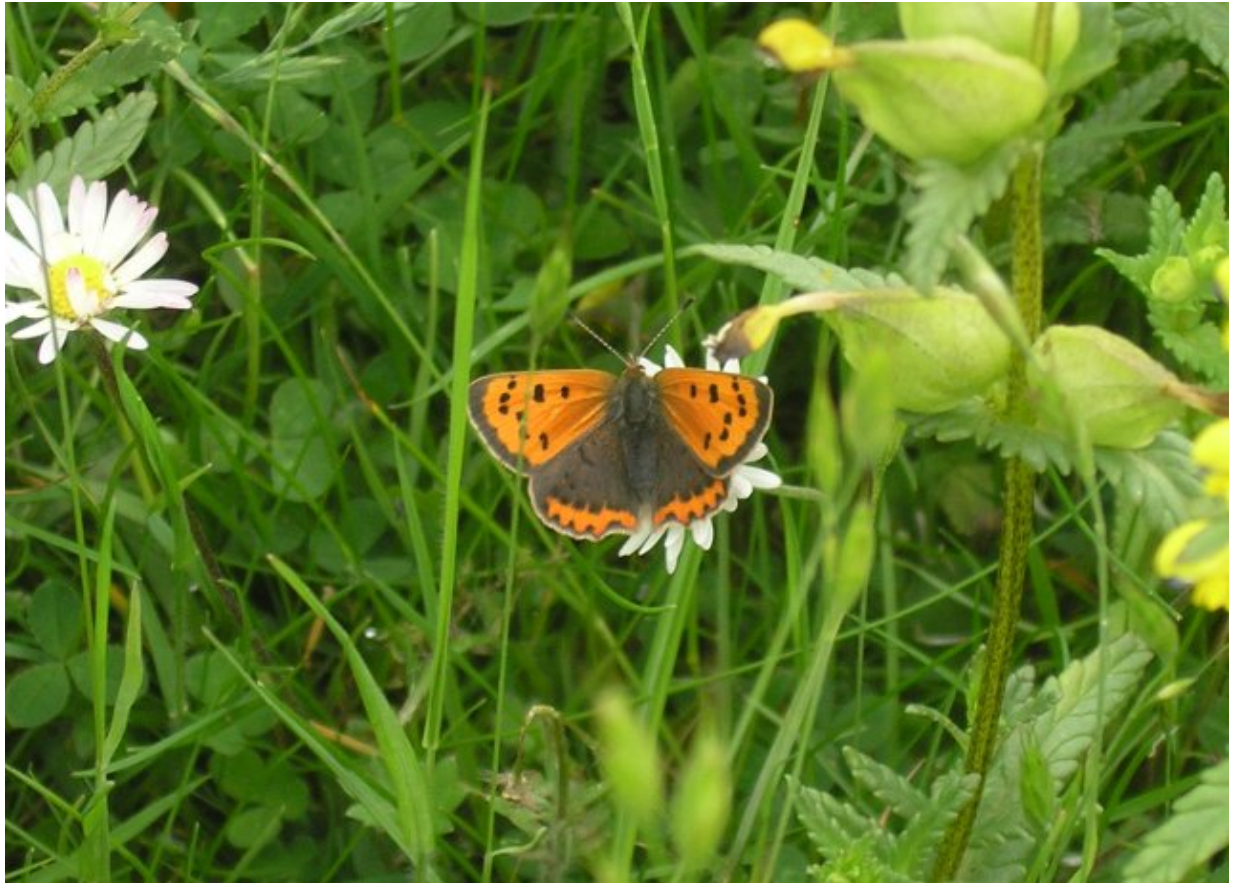
A small copper butterfly feeds on a daisy in the Far End meadow at Lower Winskill.

The traditional hay meadows at Lower Winskill provide a home, food and shelter for small mammals, birds and insects after lambing time when the grass is allowed to grow for the hay crop.