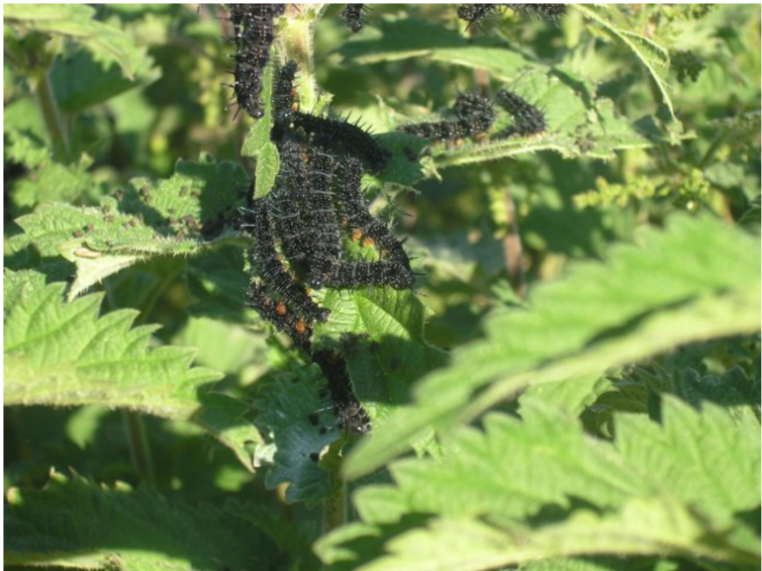
Close up of Peacock butterfly caterpillars feeding.