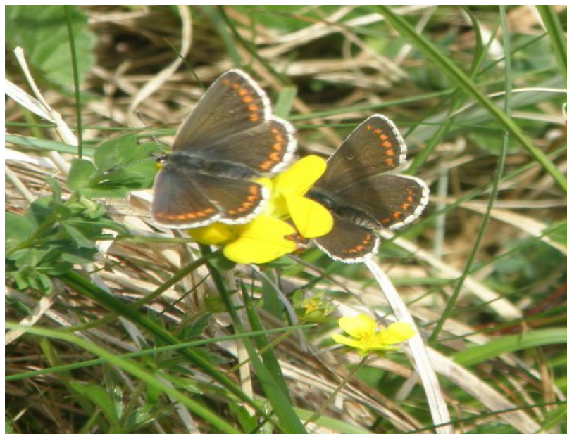
Female Northern Brown Argus butterflies.