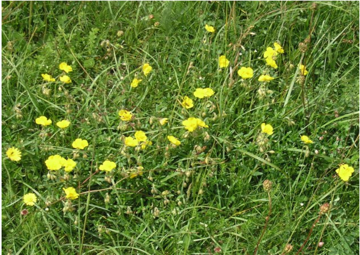
Common rock rose flowering in the Scar Edge pasture at Lower Winskill. This is the sole food plant for the caterpillars of the rare Northern Brown Argus butterfly.